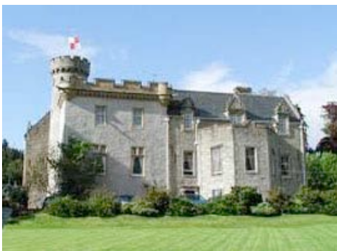
Tulloch Castle, Dingwall (Highlands)