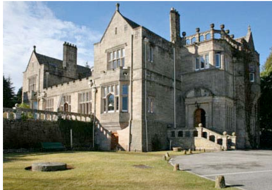
Kildrummy Castle, Kildrummy (Royal Deeside)