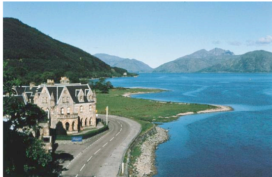
Ballachulish Hotel, near Fort William (West Coast)