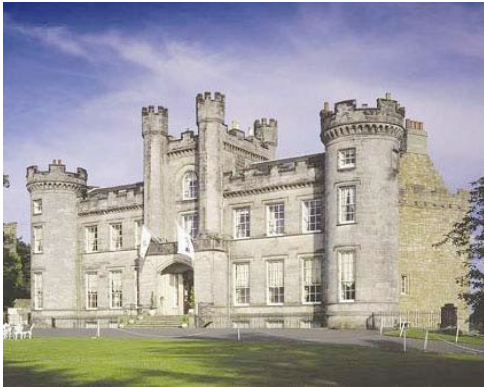
Airth Castle, near Edinburgh

«This beautiful individual 8-day car tour provides visitors with a unique experience to remember for a long time to come».