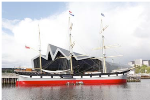
RIVERSIDE MUSEUM AND THE TALL SHIP

The festival week will climax at the World Pipe Band Championships on Saturday 13 th August at Glasgow Green , the city's oldest park space. Following the day's intense competition and the crowning of the new world champions, the party atmosphere will continue at the After Worlds Shindig – in honour of all of the competing bands.