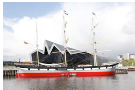
RIVERSIDE MUSEUM AND THE TALL SHIP

Whether you are a fan of traditional music already or you are simply looking for a new city break destination, visiting Glasgow during this event will not only entertain the whole family but will offer plenty of other opportunities to make this a trip worth remembering.